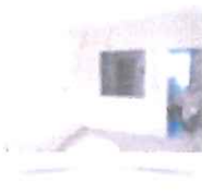
KITCHEN NEW SERVING HATCH